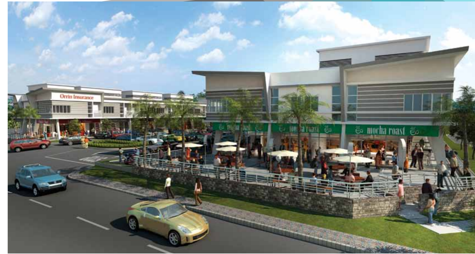
All drawings & illustrations contained herein are artists' impressions only. All plans & specifications are subject to changes by the relevant authorities and/or the developer's architect.

Thanks to the successful sales of our inaugural waterfront commercial, Promenade@8 . We are now embarking on our second chapter.