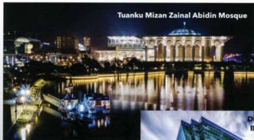
Tuanku Mizan Zainal Abidin Mosque

Much as Putrajaya discharges its primary role as the seat of our nation's government, the city has so much more to offer. From spectacular visual treats and nature inspired jaunts, to recreational ventures and adventure sports, Putrajaya is just itching to reveal the demonstrably lighter side of its personality with a range of activities that will captivate the old, the young and anyone in between.