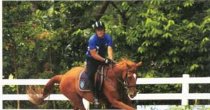
There are plentiful activities to suit all interests and ages