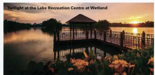
Twilight at the Lake Recreation Centre at Wetland