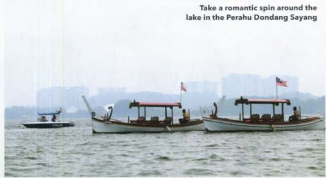
Take a romantic spin around the lake in the Perahu Dondang Sayang

is by going on a sightseeing cruise from Jeti Dataran Putra. Options include the contemporary cruise boat, the traditional Perahu Dondang Sayang or even, the self-operated Picnic Boat which allows you to enjoy al fresco meals (bring-your-own) as you gently drift along the lake.