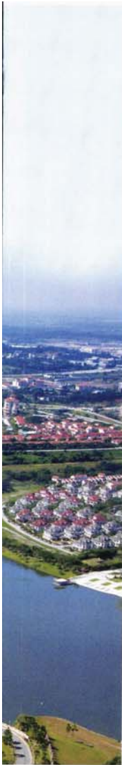
Above: The expansive boulevard is flanked at one end by the imposing Perdana Putra while the unique Putrajaya International Convention Centre stands guard at the other end