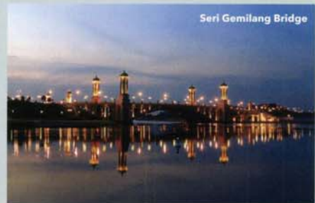
Seri Gemilang Bridge