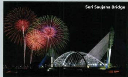
Seri Saujana Bridge

As each of these conduits sports individual design traits, pursuing the "bridge trail" has become a popular pastime in Putrajaya. Come nightfall, the illuminated bridges take on a distinctly ethereal personality casting a magical spell on their surroundings.