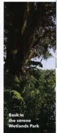
Bask in the serene Wetlands Park

Another popular attraction is the China-Malaysia Friendship Garden which was set up to celebrate the strong bilateral relations between Malaysia and China. Quaint and picturesque, the serene garden is an Instagrammer's playground.