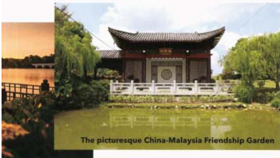
The picturesque China-Malaysia Friendship Garden