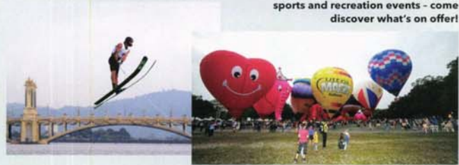
Putrajaya is an ideal destination for sports and recreation events - come discover what's on offer!

And if you time your visit correctly, visitors can ring in the New Year at the stroke of midnight with a dazzling digital lights and fireworks display.